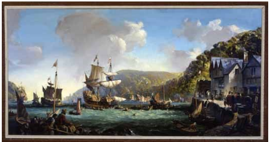
Mayflower & Speedwell in Dartmouth Harbour

We travel to Plymouth, stopping in Dartmouth for lunch, a look at the harbour where both the Mayflower and the Speedwell set sail from only to return to Plymouth when the Speedwell sprang a leak.